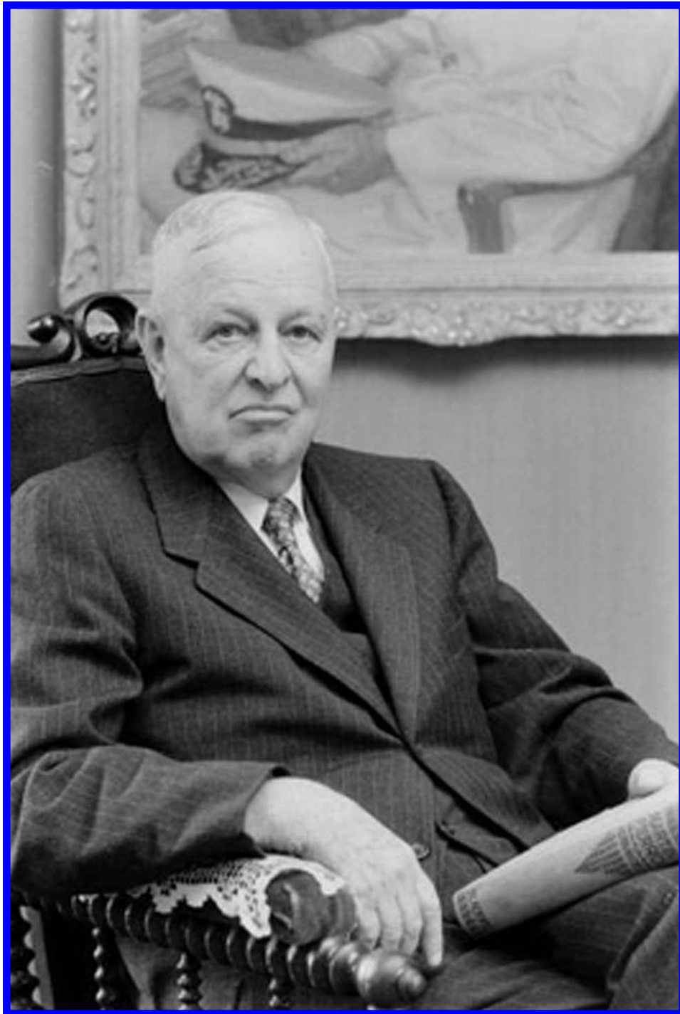
Admiral Kimmel, in his civilian years.

In his final years, he still couldn't comprehend how the "leaders" above him could have betrayed, both him and America. Typical of military (especially "Academy") training (brain washing or mind-control) it is simply unthinkable to consider any superior as a traitor.