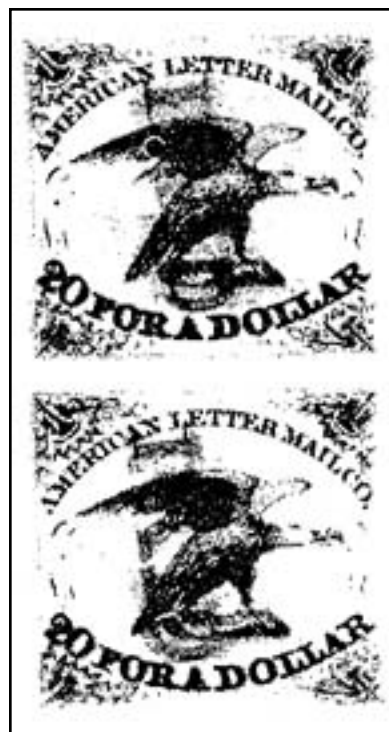
The referred stamps, produced by the American Letter Mail Company, are shown above. Please note that they have been enlarged for clarity.