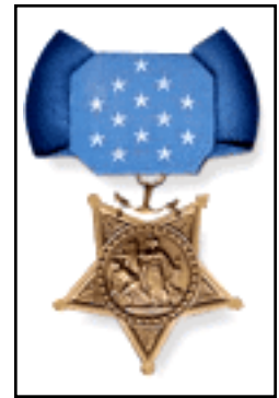
Smedley Darlington Butler (July 30, 1881 – June 21, 1940).

Major General in the U.S. Marine Corps and, at the time of his death, the most decorated Marine in U.S. history.